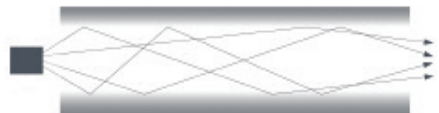
Multimode Step-Index Fiber

Multimode Graded-Index. Fibers were designed to limit the amount of modal dispersion. The index of refraction of the core changes gradually from the center point outward. This causes the velocity of the modes to increase as they travel away from the core. This equalizes the time it takes the multiple modes to travel down the fiber to reduce modal dispersion and increase bandwidth.